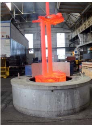
Fig. 1: Huge samples of the steel described here undergoing heat-treatment (in this case austenitisation). For more details, see Nanostructured bainite, Proceedings of the Royal Society of London - A, Vol. 466, 2010, 3–18, and The first bulk nanostructured metal, Science and Technology of Advanced Materials 14 (2013) 014202. The first bulk nanostructured metal These and other articles can be downloaded from www.msm.cam.ac.uk/phase-trans/2010/nano.html

Hundreds of tonnes of the material has been produced and utilised in a variety of specialised engineering applications such as shafts and armour. The new science associated with this material, including a remarkable new Fe-C phase diagram, will be described.